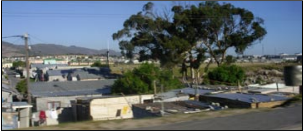
Squatter Camps, post Apartheid South Africa See his article, above.