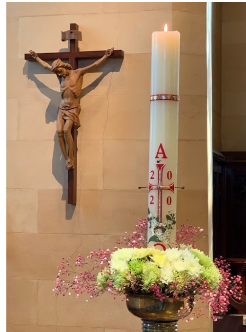
The Paschal Candle has been lit each Sunday this Easter Time

Come Holy Spirit, heal and restore your creation.